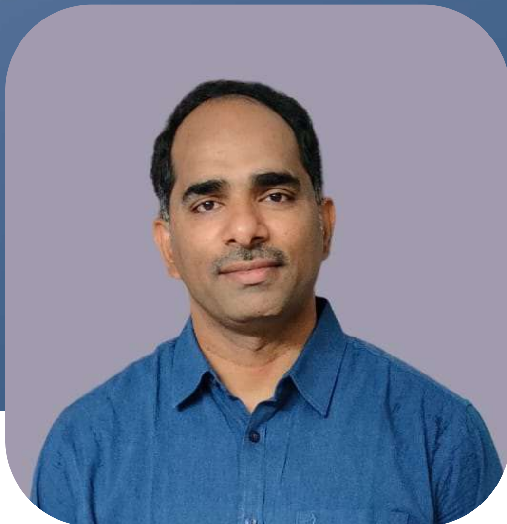
Dr. G. Kiran Kumar